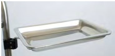
■ Holder with tray 260x180 mm Ref.113