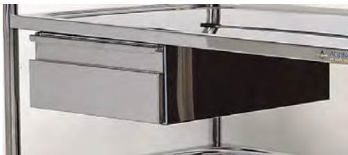
■ Stainless steel drawers for shaped trays Easy to set on 600x400 or 750 500 trolleys Two small models can be set side by side.

Small model usefull dim.255x400x115 mm Ref.151 (for 600 x 400) Ref.153 (for 750 x 500)