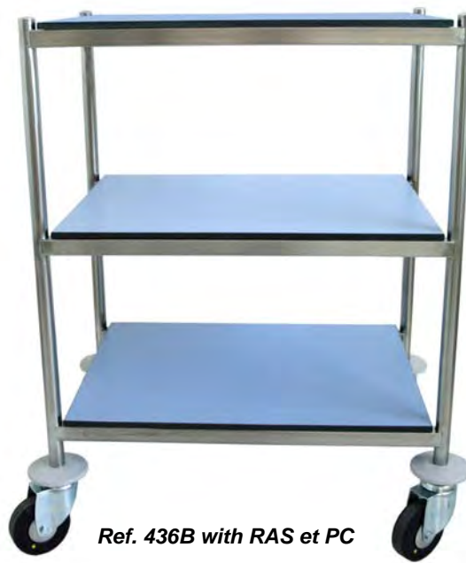
Ref. 436B with RAS et PC