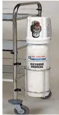
■ Gas holder Ref.111