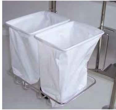
■ Twin bags holder 10 L Ref.220