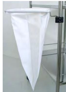
■ Swivel plastic bag holder Ref.114