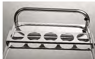
■ Drop bottles rack For trolleys 750x500mm Ref. 752P

Large model usefull dim.550x400x115 mm Ref.152 (for 600 x 400) Ref.154 (for 750 x 500)