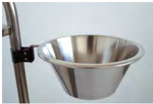
■ Holder with basin Ø 200 mm 2 liters Ref.112