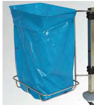
■ Swivel plastic bag holder 30 L Ref. 120