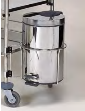
■ Holder and stainless steel waste bin Réf.110