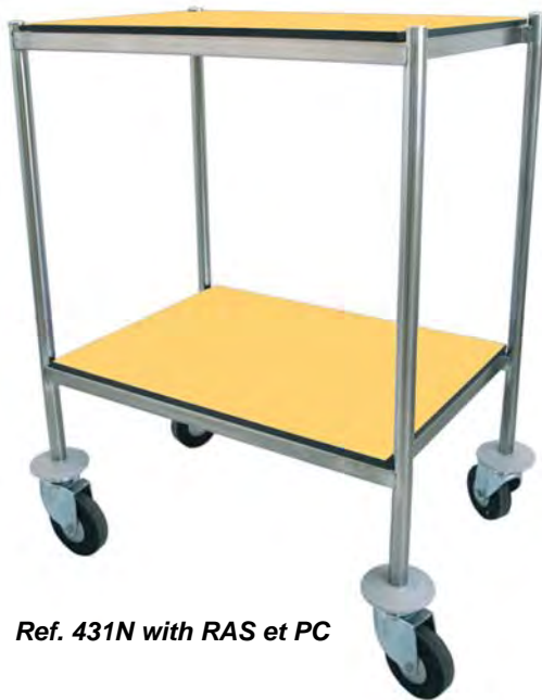
Ref. 431N with RAS et PC