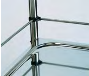
■ Guard rail and clip ref. P27 (See page 3)