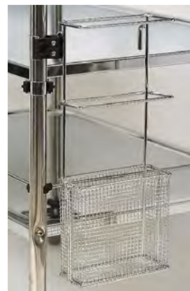
■ Probe/catheter holder Ref.508