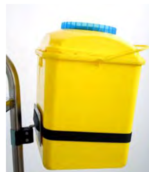
Ref. 123 (without box)