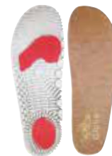
*ALWAYS SUPPLIED WITH FOOTWEAR ONLY