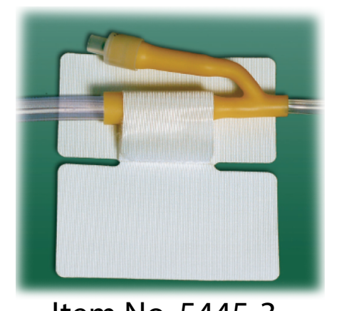
Item No. 5445-3 GMS Code: 93909 Cath-Secure with 2.75"Tab 50/Box