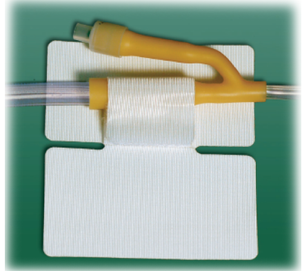
Item No. 5445-2 GMS Code: 93910 Cath-Secure with 2.5"Tab 50/Box