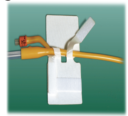
Item No. 5445-4 GMS Code: 93907 Cath-Secure Dual Tab 50/Box