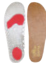
*ALWAYS SUPPLIED WITH FOOTWEAR ONLY