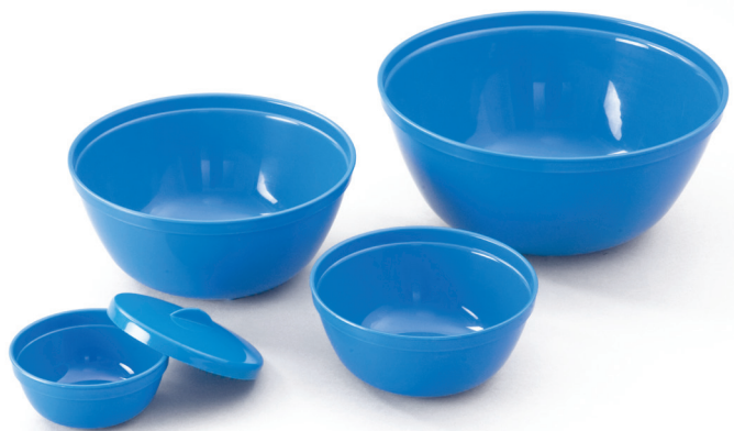
Pictured L-R: LB100B (shown with LB100B LID), LB200B, LB150B, LB250B