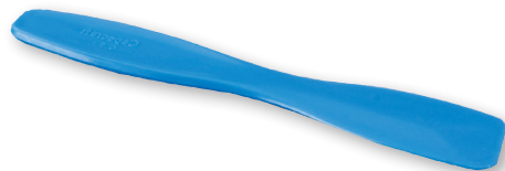
Pictured: CS1B Please contact sales staff to discuss Spatula & Bowl Set requirements