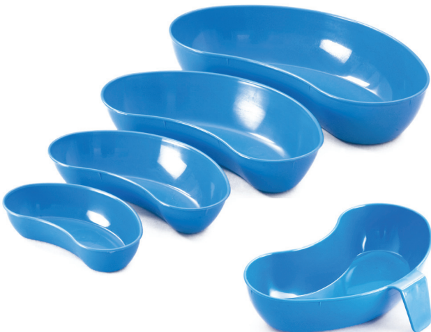
Pictured L-R: KD150B, KD200B, KD250B, KD300B & VB12B