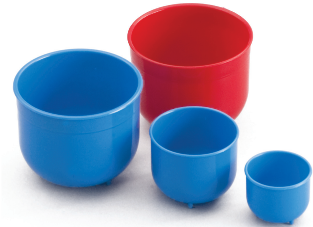
Pictured L-R: GP80B, GP80R, G60B, GP40B