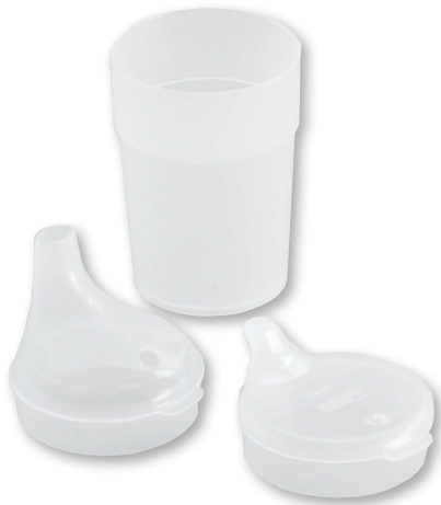
Pictured: L-R: BK1N, TFW, TFN