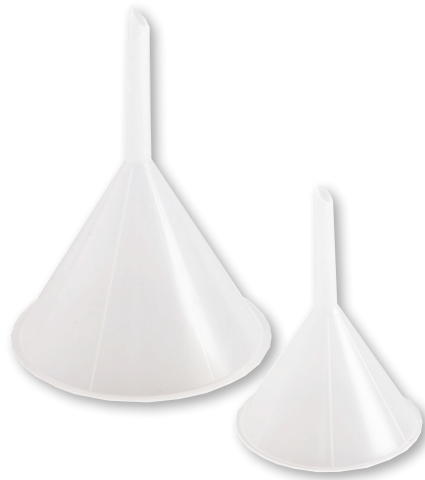
Pictured: F100N, F150N