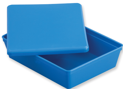
Pictured: IT200B, ITL200B